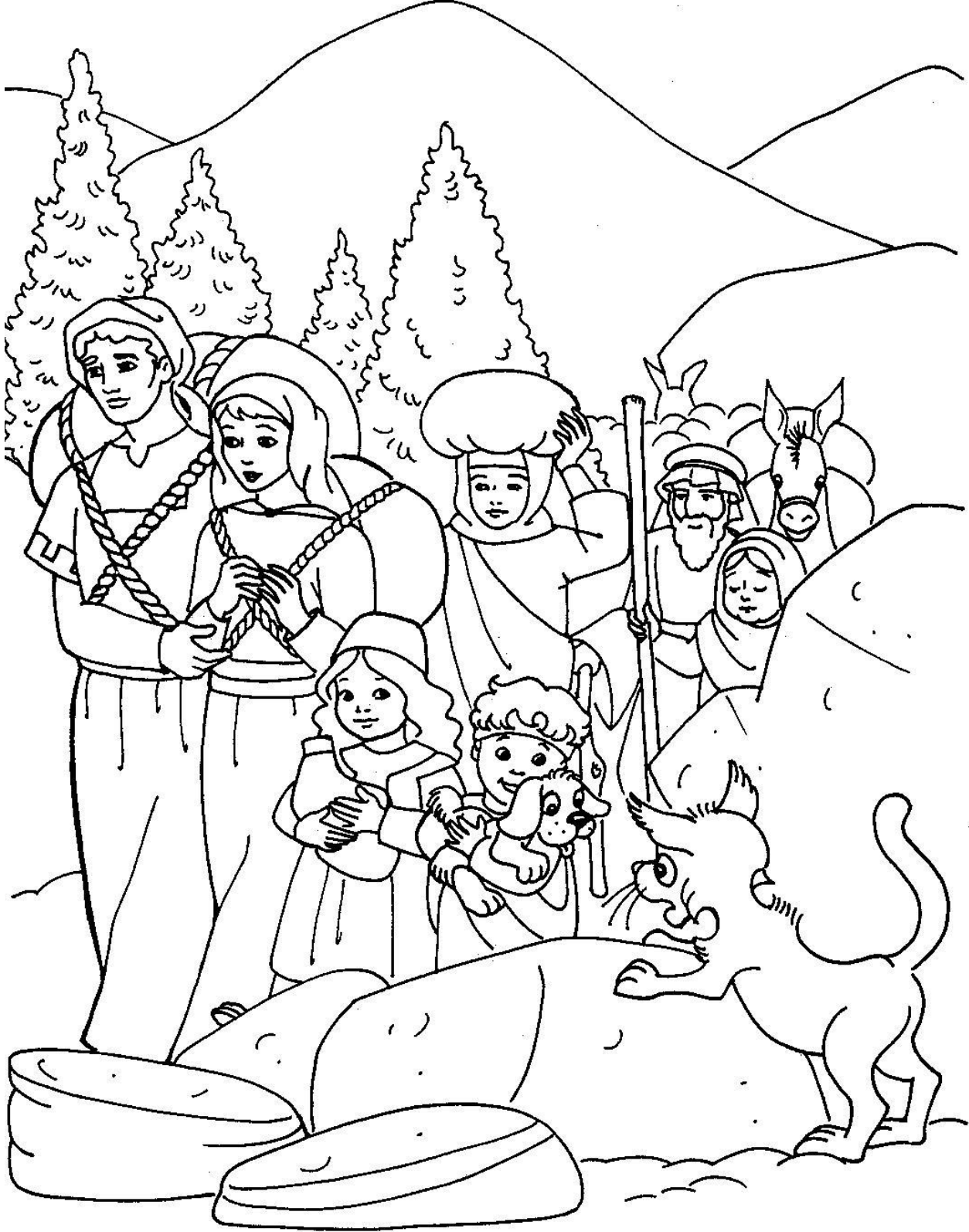
The Israelites hurry out of Egypt towards the Red Sea