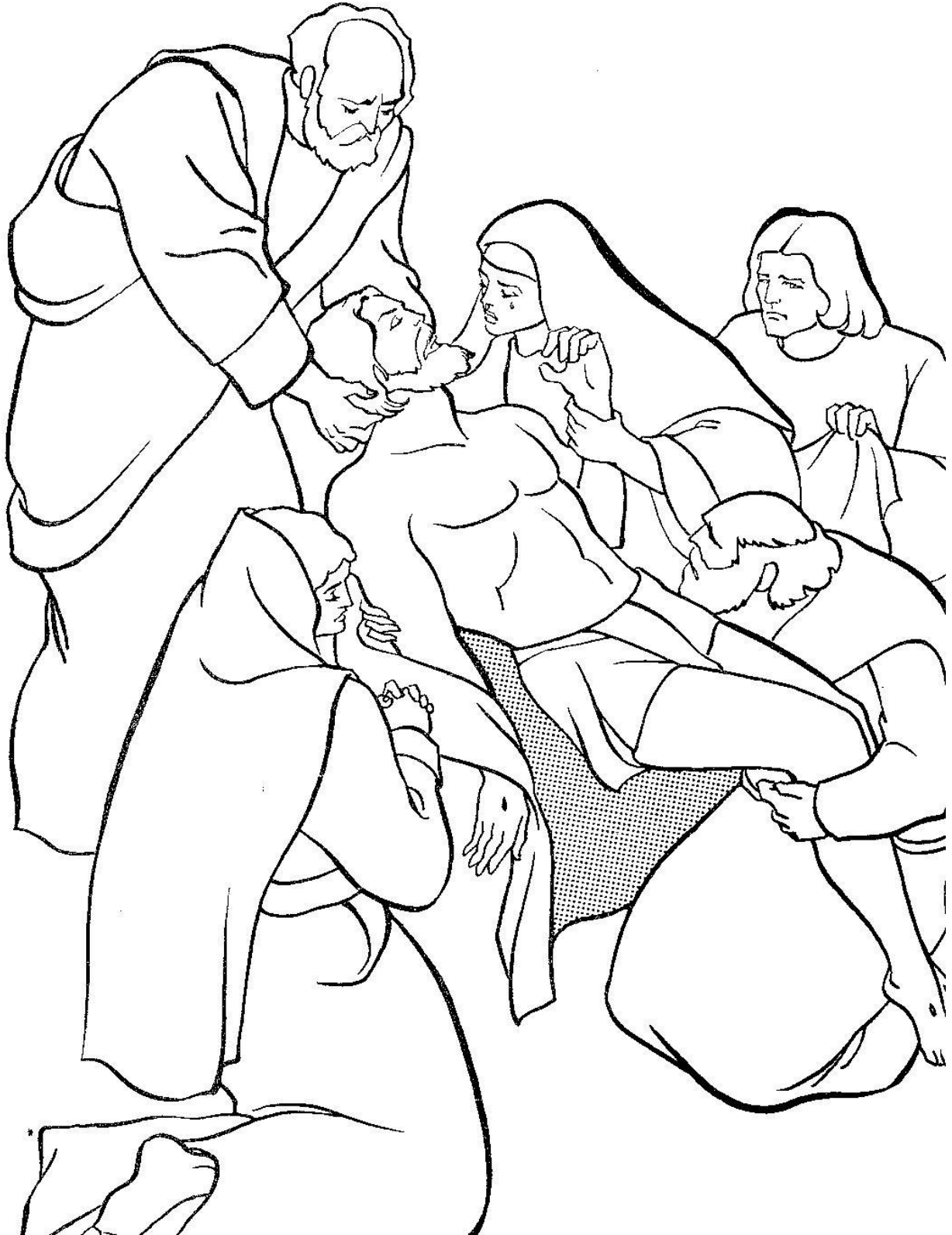
The Israelites mourn Aaron's death