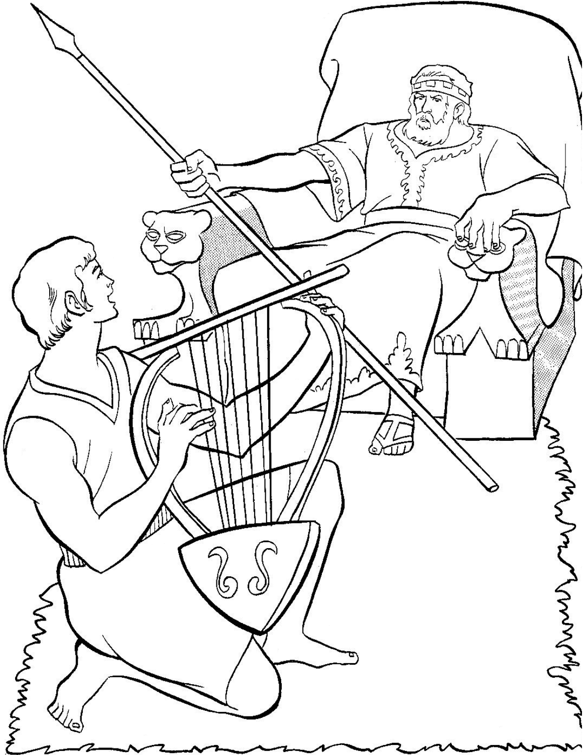
David plays the harp for King Saul